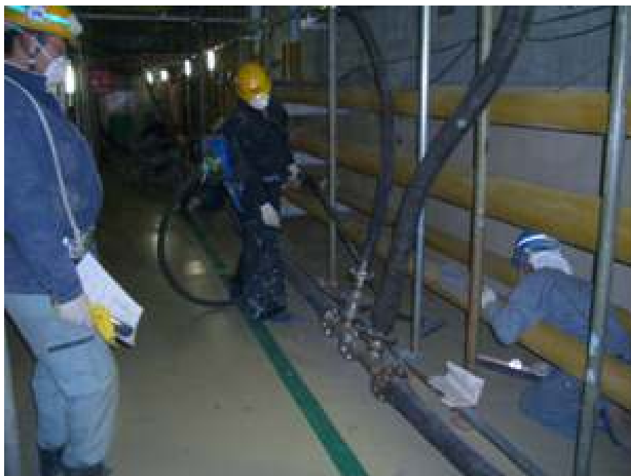
Figure 1 Clean plant action (scene of general cleanup)

The most noteworthy effort to reduce crud is the "Clean Plant Activities" that has been carried out in a consistent manner since the early stage of construction. With the aim of improving work environment, protecting, storing and managing piping and components (maintenance of inner surface cleanliness), controlling wash and storage water chemistry, and reducing the amount of waste generated during construction work, the Clean Plant Activities were carried out in an organized way by all employees engaged in construction.