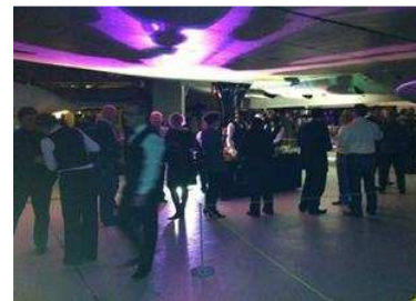
Photo from Congress Dinner at Imperial War Museum

The ISOE Symposium and the initial meetings of RPMs and regulatory body representatives illustrate that Radiological Protection Specialists are a global community, with well-aligned ambitions and common challenges. We strengthen our chances of further success by networking effectively and by sharing our experiences.