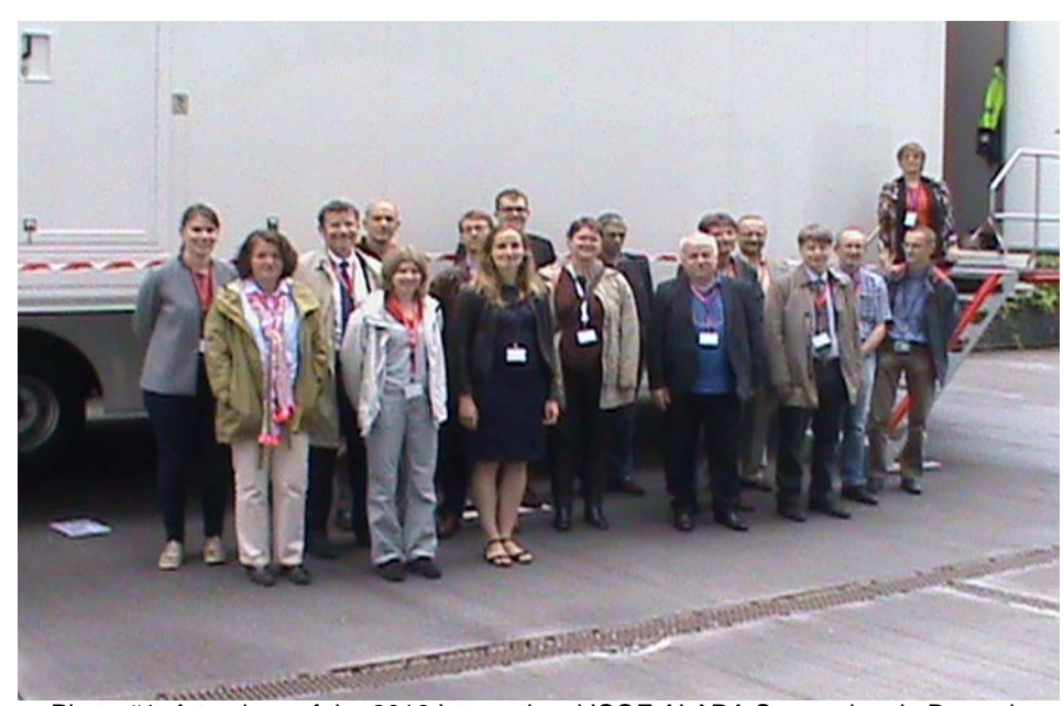
Photo #1: Attendees of the 2016 International ISOE ALARA Symposium in Brussels touring the ENGIE Electrabel Emergency Radiological Response Truck

A specific discussion was organised on the issue of preparedness for accident management from the RP point of view, including a presentation of the "Nuclear Logistic Support Cell" created at the corporate level of ENGIE Electrabel and a visit to the support trailer.