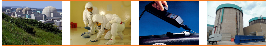
Photo credits: The Hanul Nuclear Power Plant, Korea (Creative Commons, IAEA Imagebank); AREVA Mox fuel fabrication plant, Cadarache, France (AREVA, Taillat Jean-Marie); Nuclear gauge (US Nuclear Regulatory Commission); Zion Nuclear Power Plant in the United States (NEA).